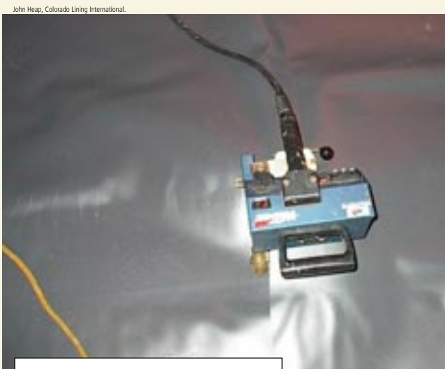
Photo 1b. Hot-wedge welding.

the outside of the seam, whereas the peel test fails the seam from the outside towards the inside of the seam. The impact of this difference, if any, is a subject of the ongoing research, but it does not impact the results herein because PVC seam requirements are specified in terms of peel strength, and the burst pressure is simply being correlated to this specified parameter. The required value for the peel strength of both 0.75- and 1.00-mm (30- and 40-mil)-thick PVC seams, according to the PGI material specification (PGI 1997), is 2.6 N/mm (15 ppi).