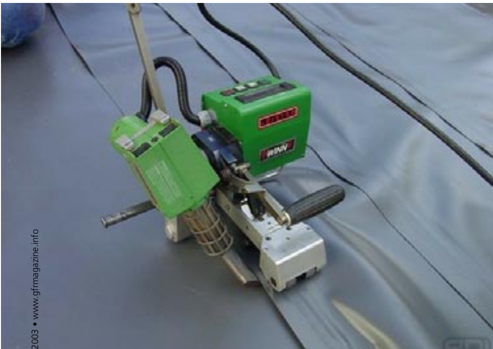
Photo 1a. Dual-track welding PVC geomembranes at TRI/Environmental in Austin, Texas.

Fred Rohe, Environmental Protection Inc.