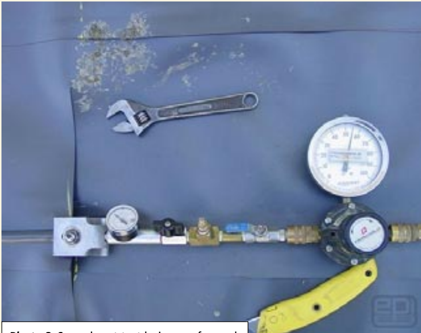
Photo 3. Seam burst test being performed.

The main contribution of the air-channel testing research is the development of a relationship between peel strength at room temperature (22.8°C; 73°F) and the burst pressure at sheet temperatures ranging from 22.8 to 46.7°C (73 to 116°F) as shown in Figure 1 . This relationship was developed from the test results obtained during the research program and from Arrhenius modeling that allows the data to be extended to sheet temperatures below 22.8°C and above 46.7°C. This relationship allows field personnel to perform seam QA/QC operations without conducting destructive tests because the seam peel strength can be measured indirectly by applying air pressure to the air channel in a dual track weld. This field air channel test can be used instead of destructive seam testing, which has the advantages of not cutting holes in the geomembrane, no geomembrane surface preparation such as grinding, and no patching the resulting geomembrane.